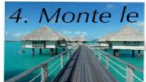
4. Monte le