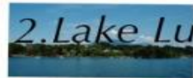
2. Lake Lucerne