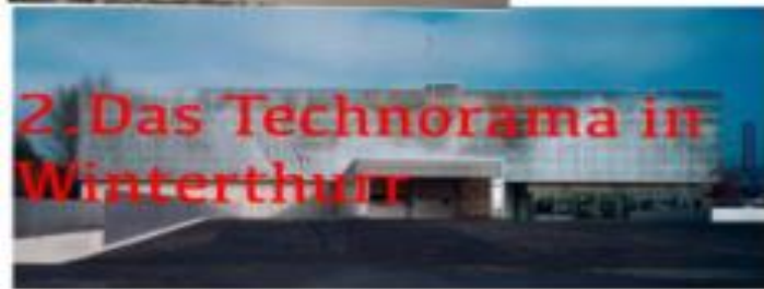
2. Das Technorama in Winterthur