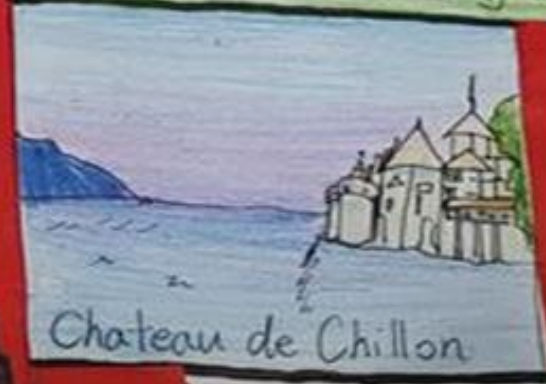
Chateau de Chillon