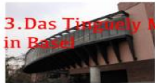
3. Das Tinguely Museum in Basel