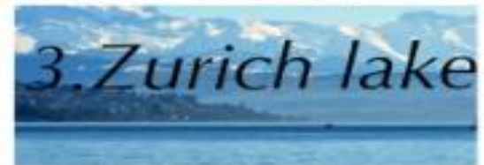
3. Zurich lake