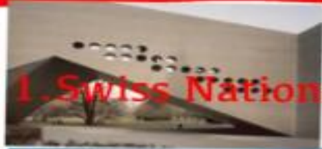
1. Swiss National Museum

There are national museum that you can tour too, it is all filled will interesting object